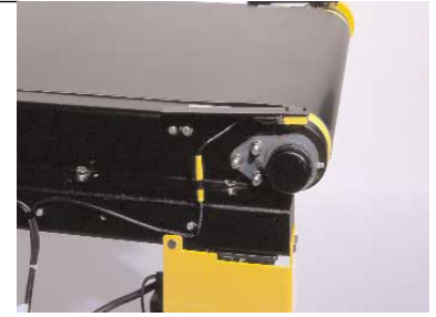
Bearing design makes belt adjustments simple and fast.