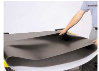
Modular design makes conveyor belt changes a breeze.