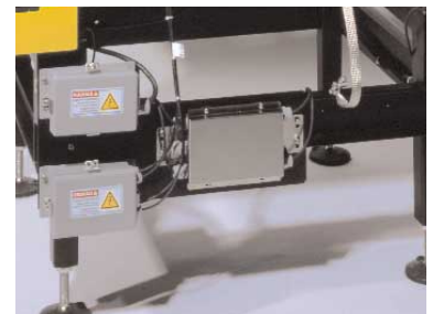
Large, open base makes for easy clean-up.